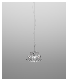
NOVEC SP P