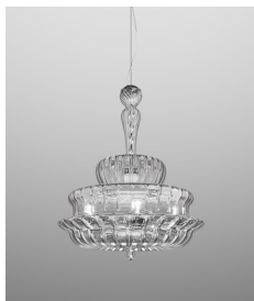
NOVEC SP G