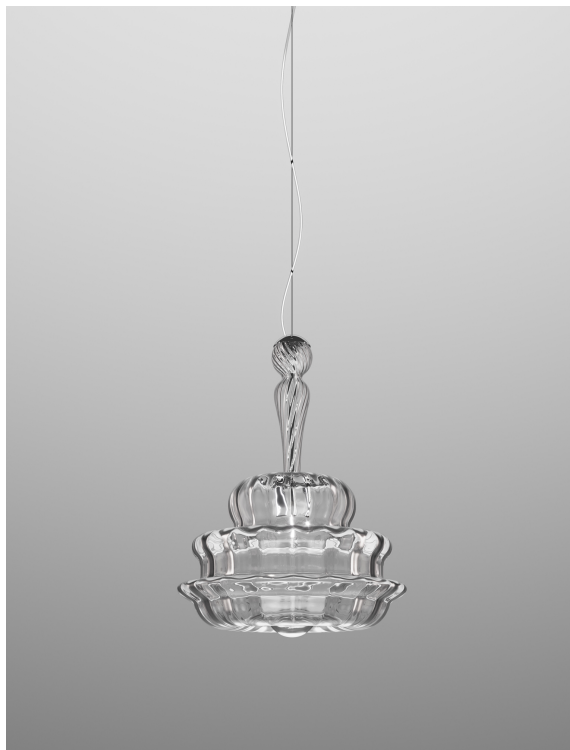
NOVEC SP M CRRI CR E27 CE